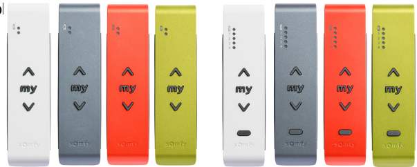
Situo 1 io Pure, Titane, Metal Orange, Metal Green